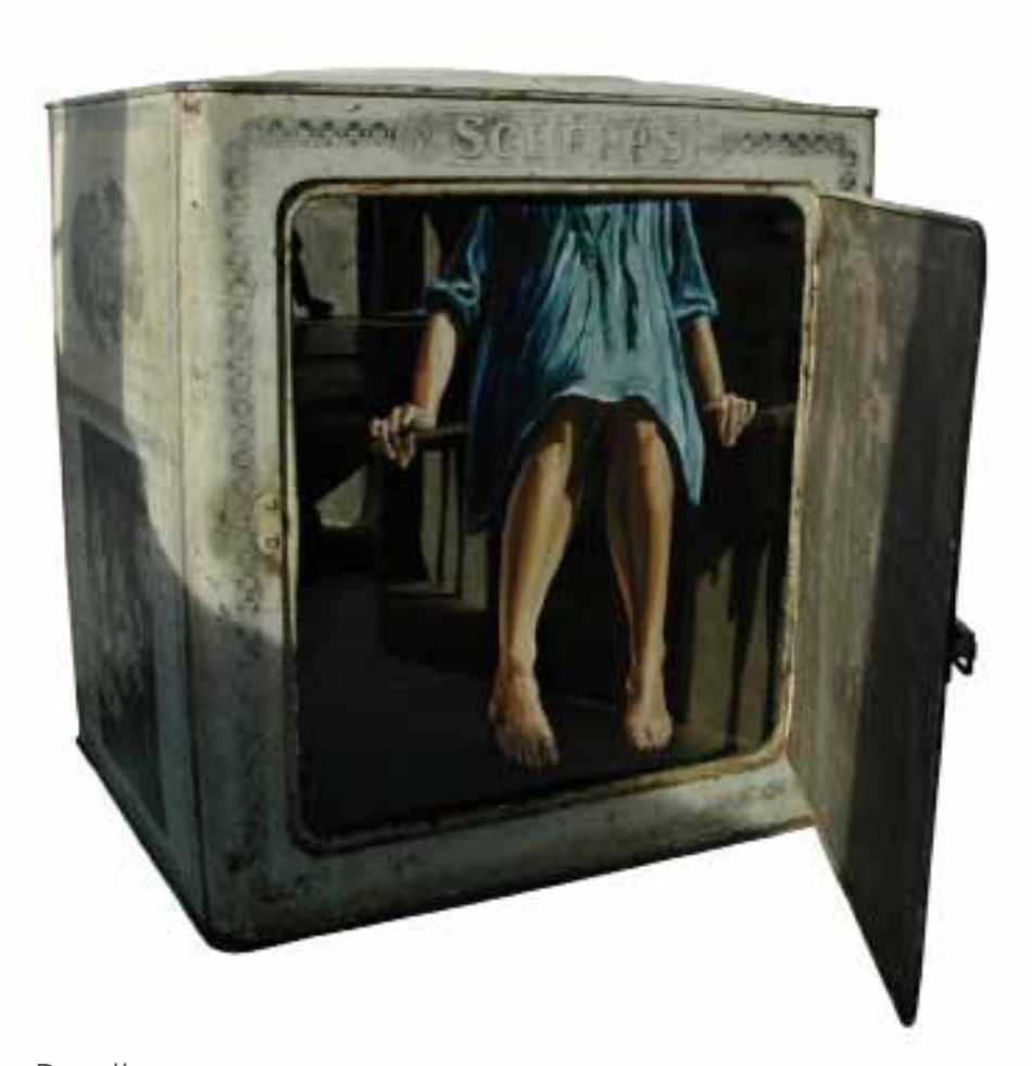
Dorothea oil on mirror and glass inside vintage tin 37 x 34 x 30cm