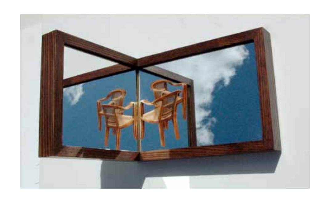
Coalescence oil on mirror 17.5 x 26 x 21cm