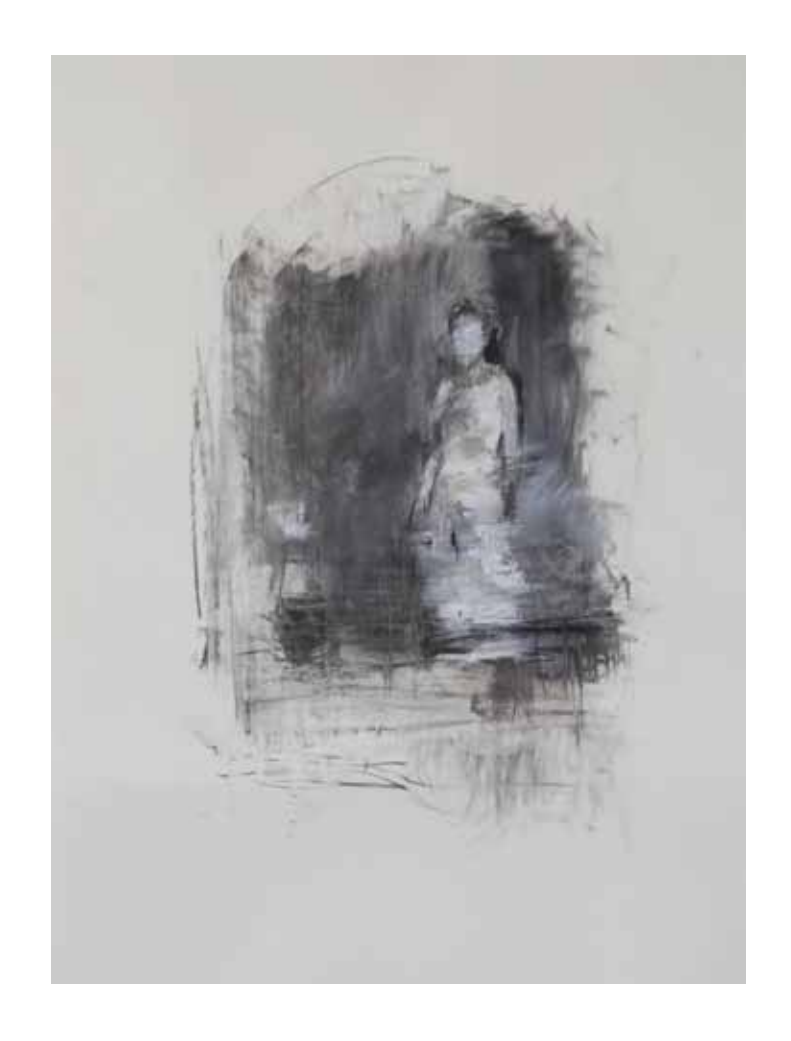
Study of a Nude in Water II graphite and conté on paper 64 x 48cm