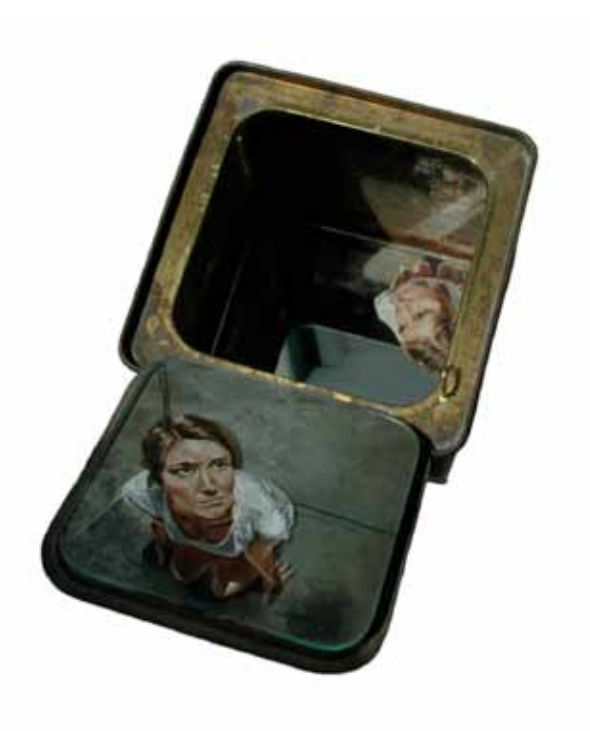
The Inner Search oil on mirror and glass inside vintage tin 30 x 16 x 16 cm