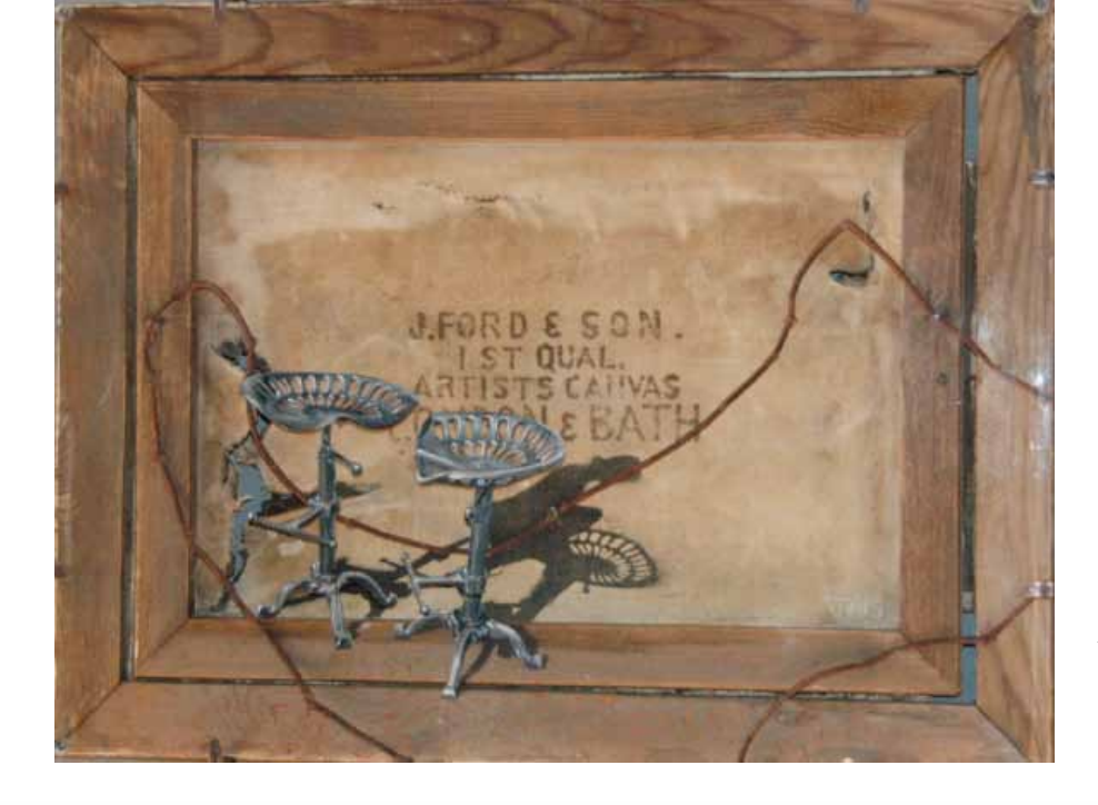
Always With Me oil on glass laid onto reverse of framed vintage stretcher 34 x 44cm