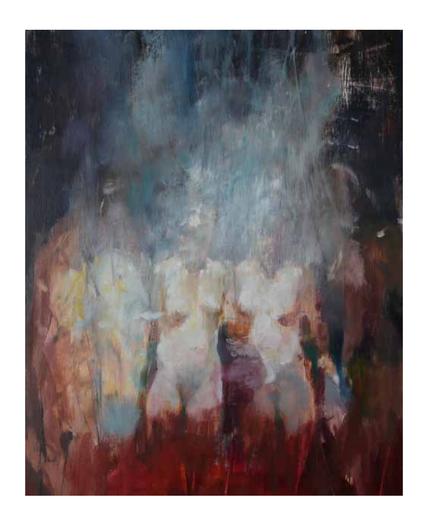
Figures in the Light oil on wood 39 x 48cm