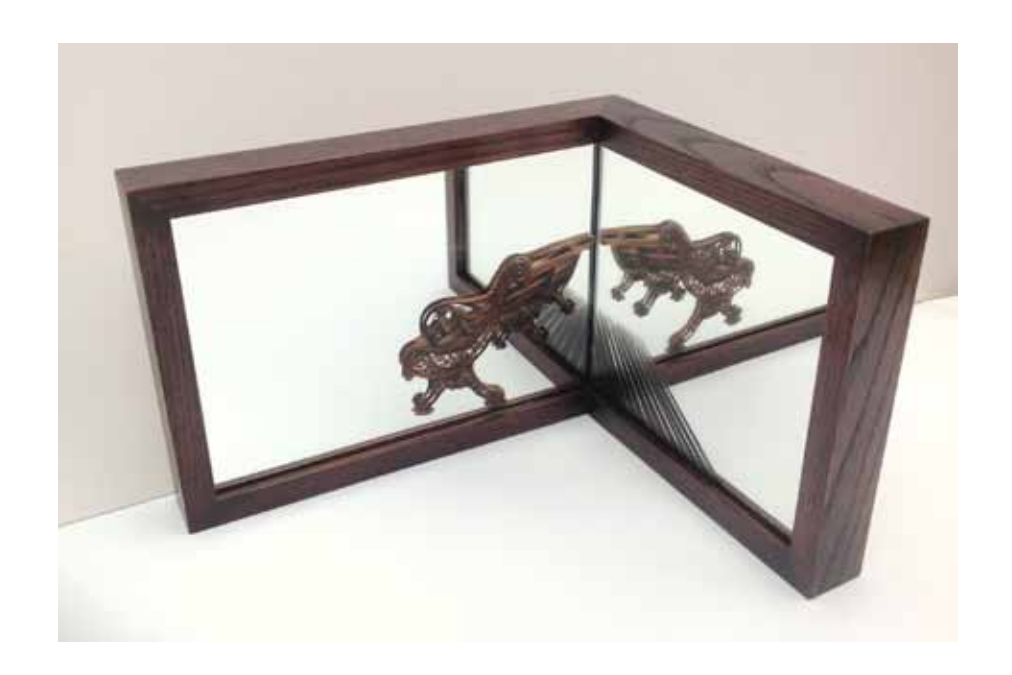
Memory Lane oil on mirror 17.5 x 26 x 21cm