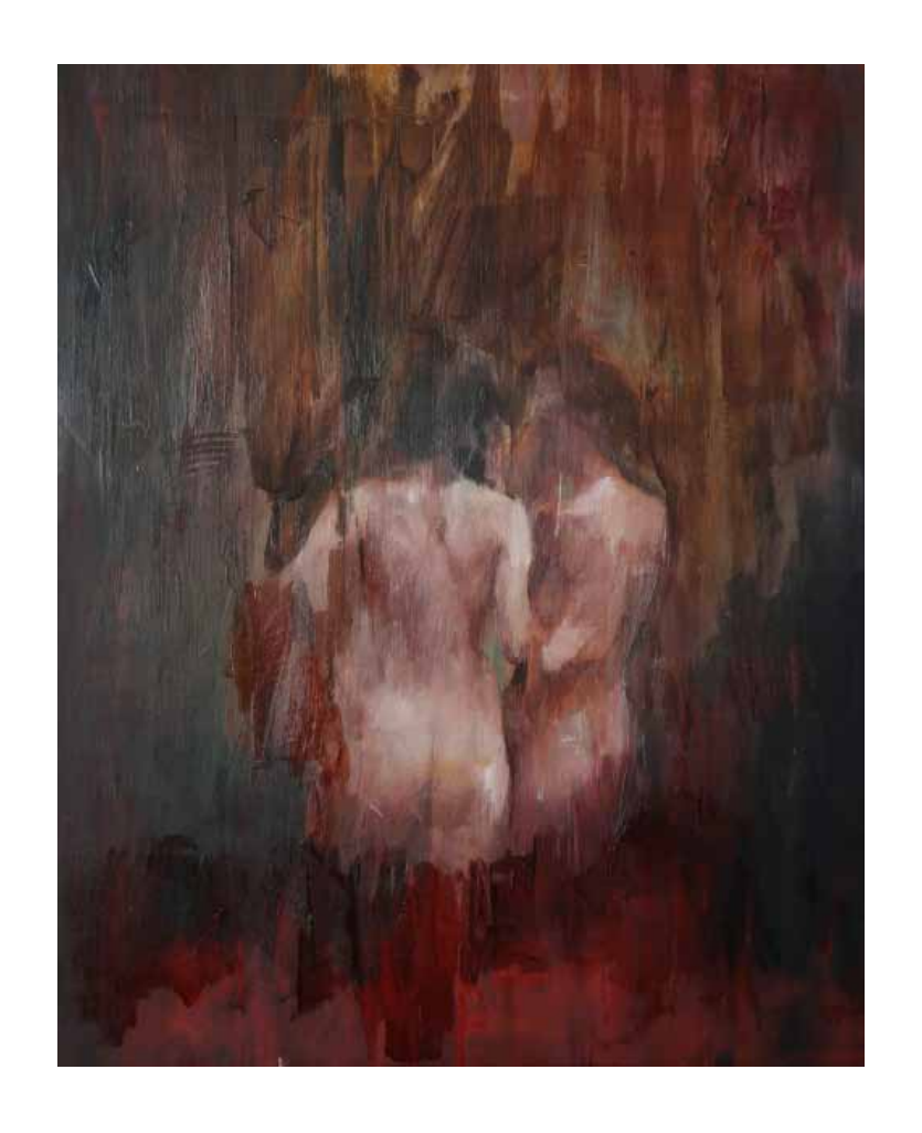
Two Figures in the Dark II oil on wood 39 x 48cm