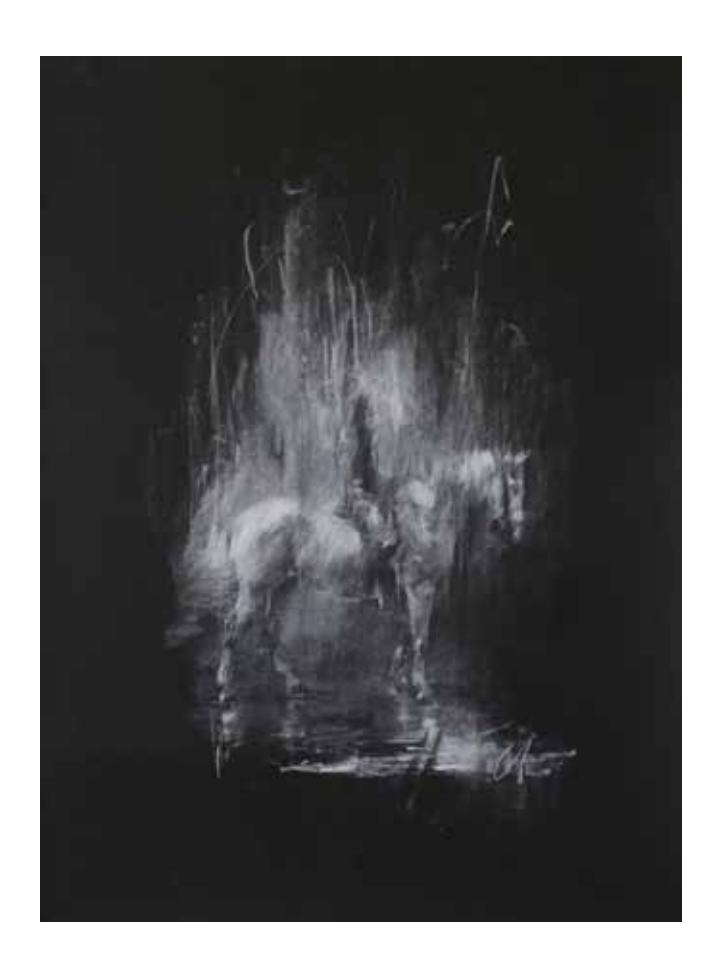
Study of a Horse and Rider conté on black paper 76 x 57cm