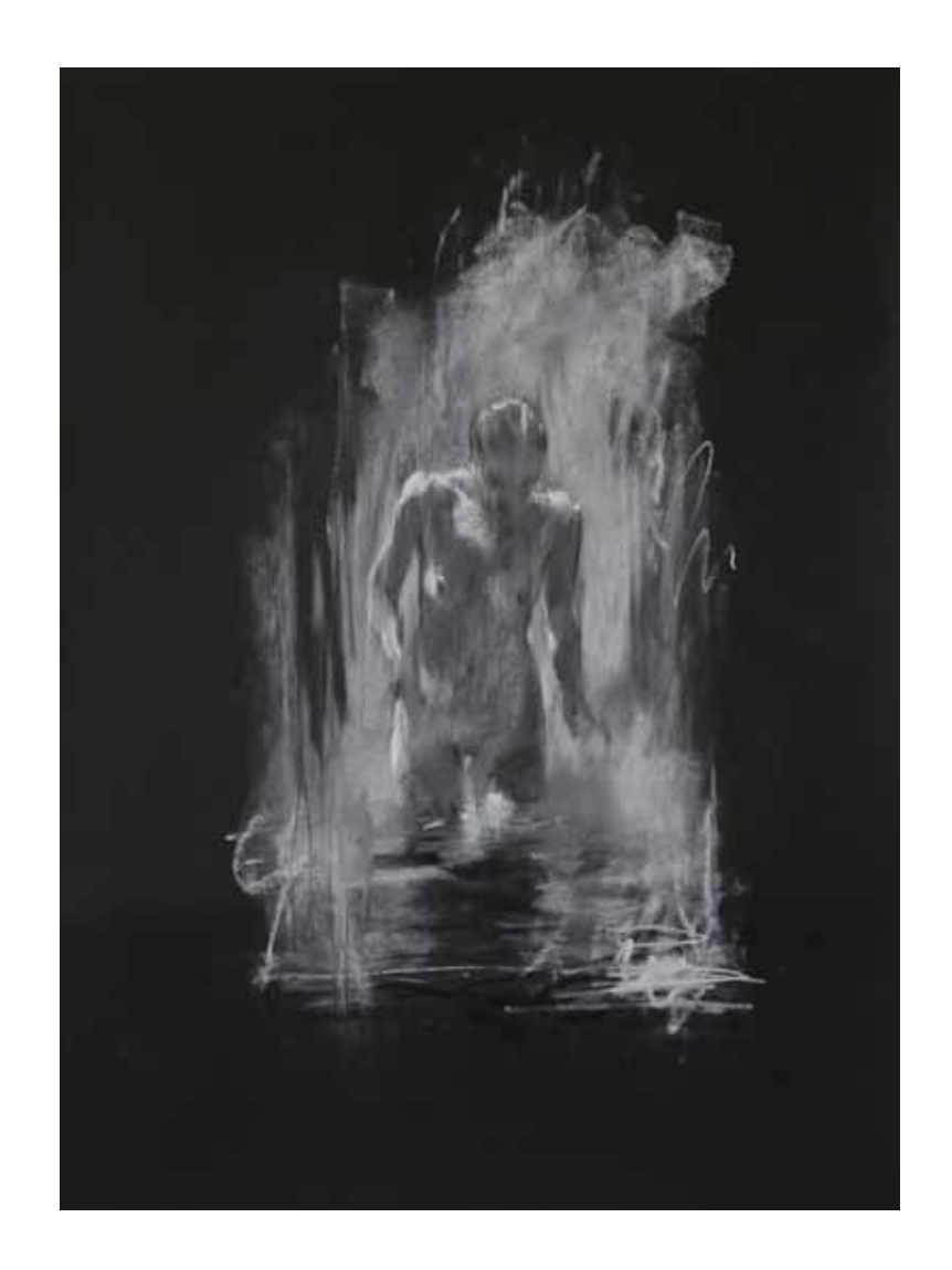
Study of a Nude in Water I conté on black paper 76 x 57cm