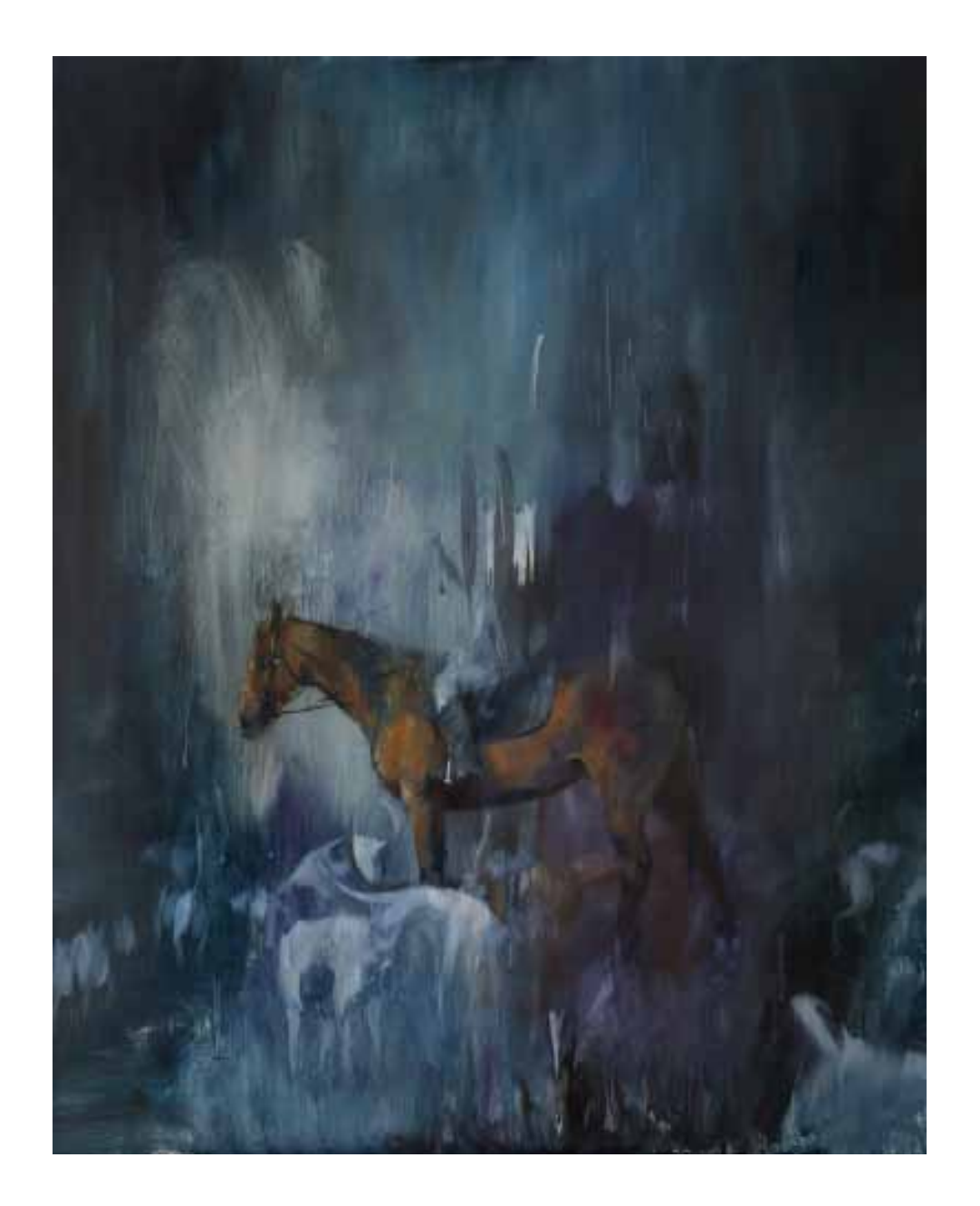
Horse with Dogs oil on wood 61 x 76cm