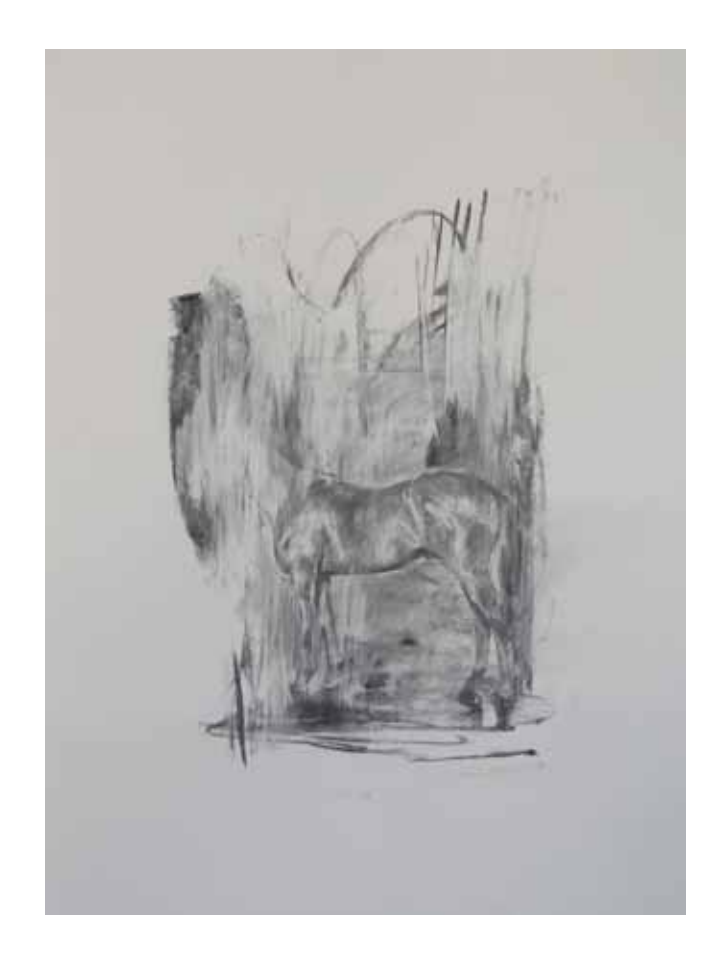
Study of a Thoroughbred graphite and conté on paper 64 x 48cm