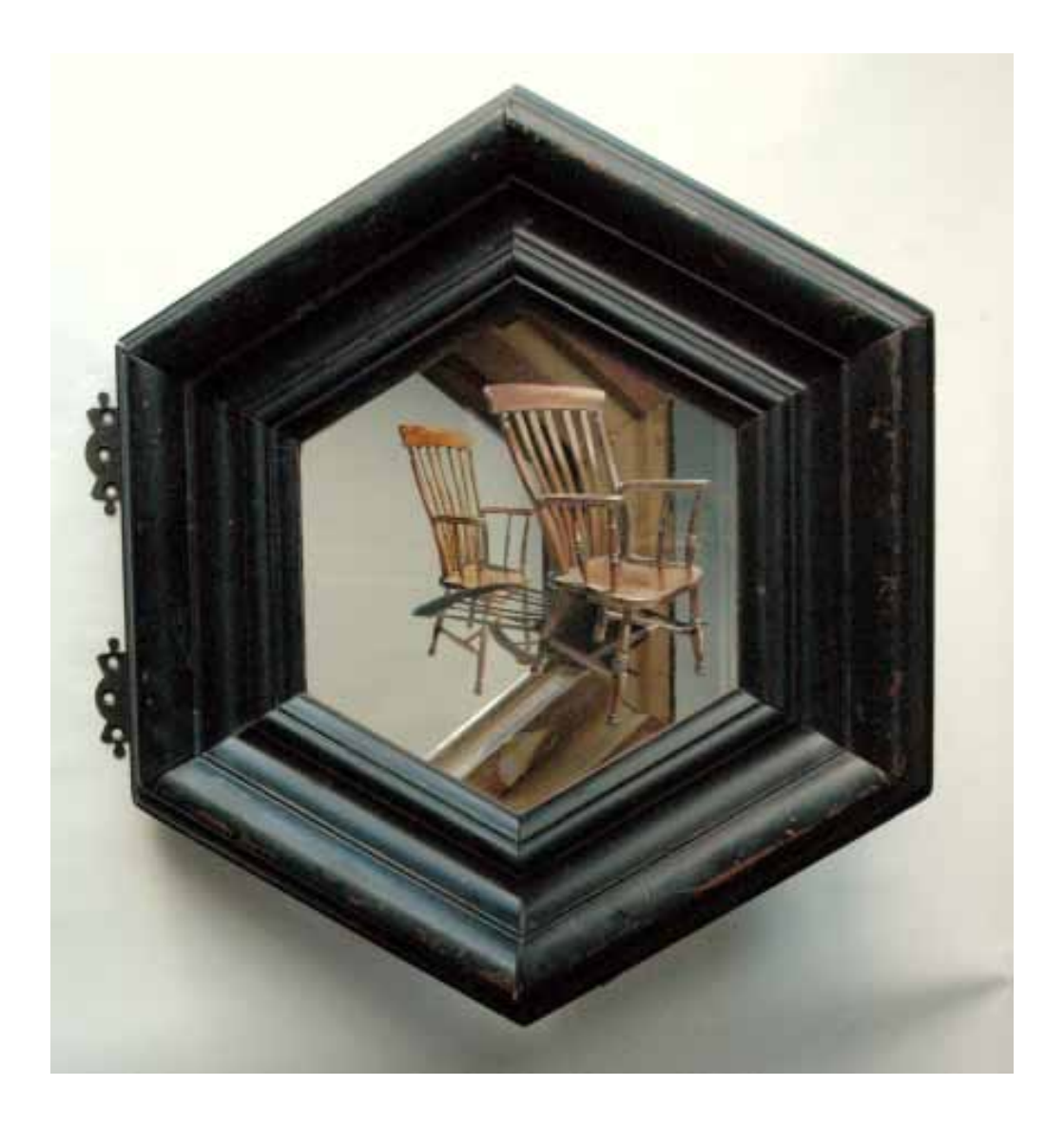
What Lies Beneath oil on glass and mirror within hinged Victorian frame 39 x 34 x 22cm