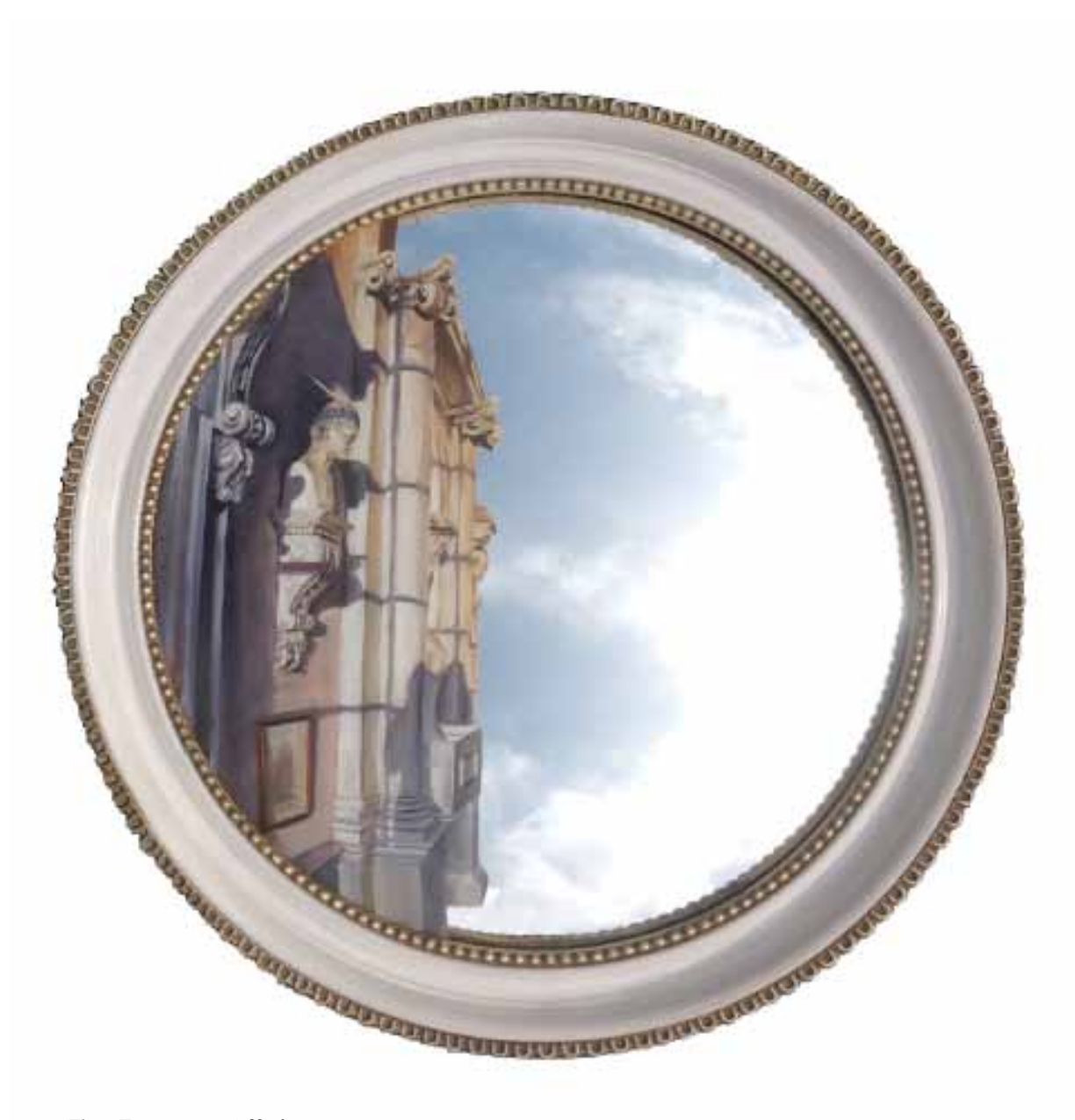
The Trounce Affair oil on vintage convex mirror 37 x 37 x 4cm