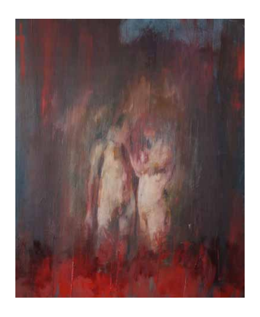
Two Figures in the Dark I oil on wood 39 x 48cm