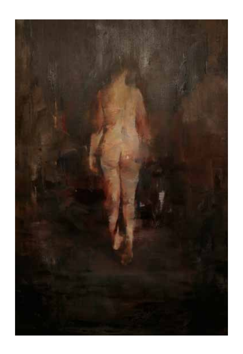
Walking into the Dark oil on linen 61 x 86cm