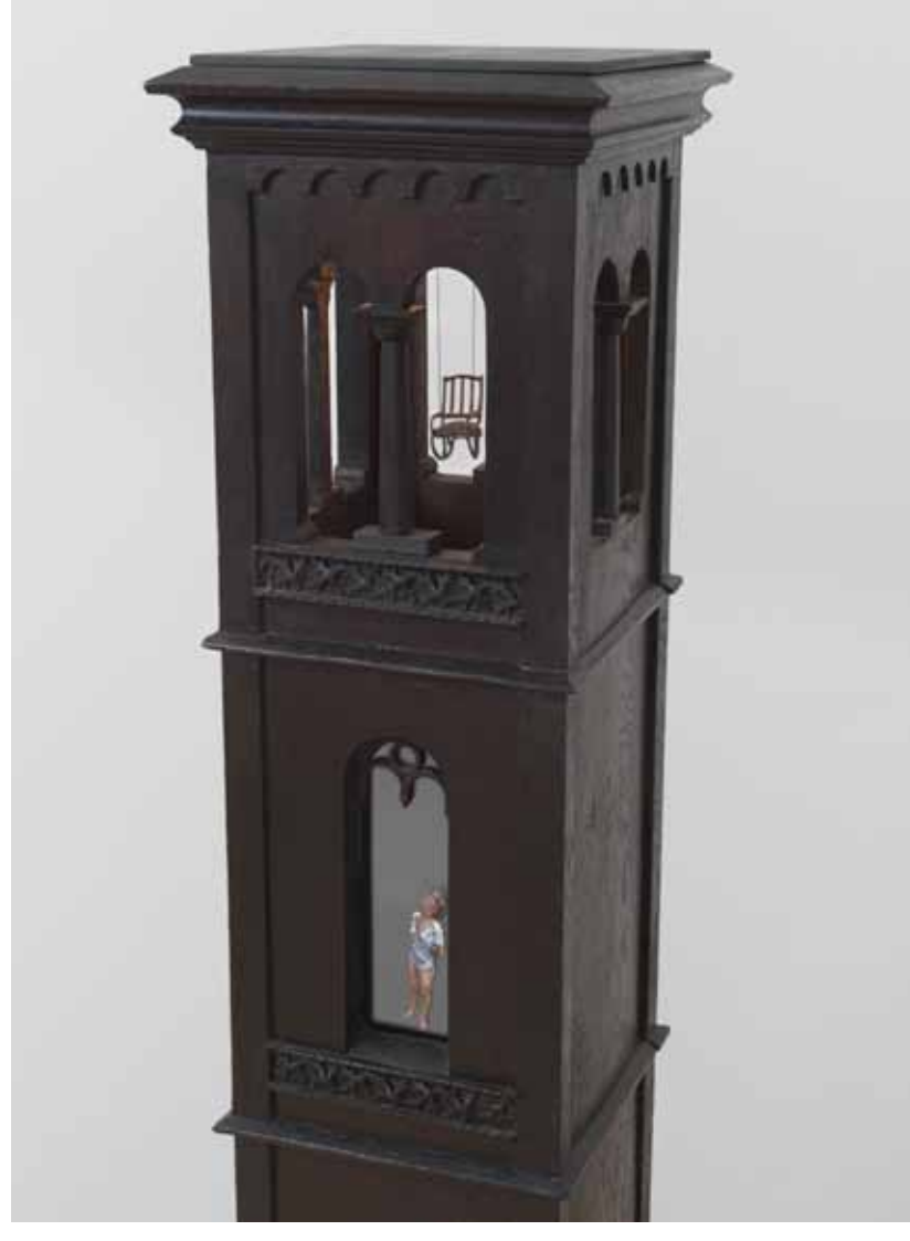
She Knows oil on glass & mirror magnets & electric lighting within a Campanile plinth 147 x 30 x 32 cm