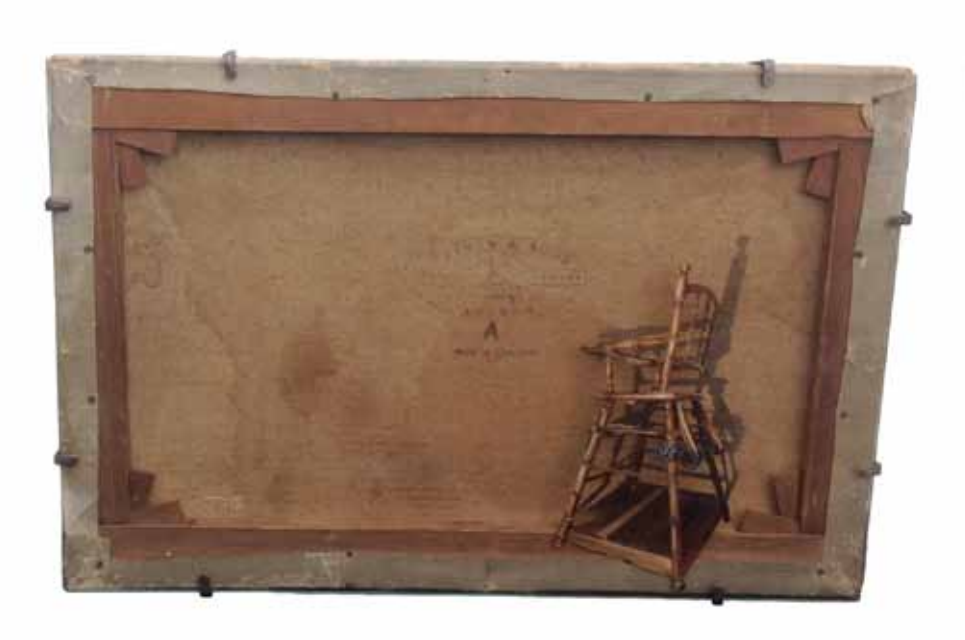
As Is Meant oil on glass laid onto reverse of vintage stretcher 32 x 47cm