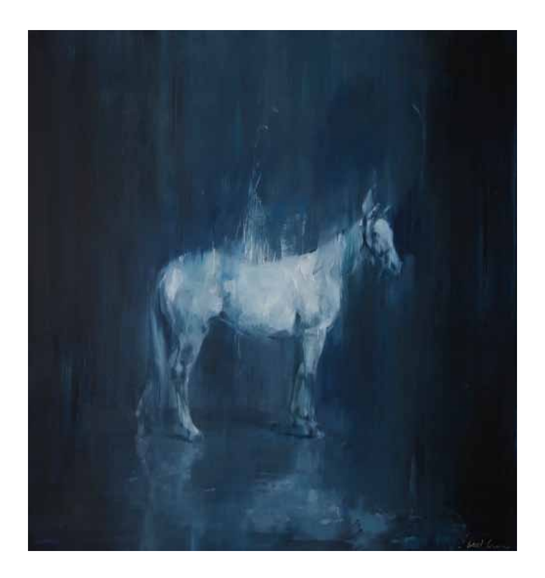
White Horse in the Light oil on wood 51 x 54cm