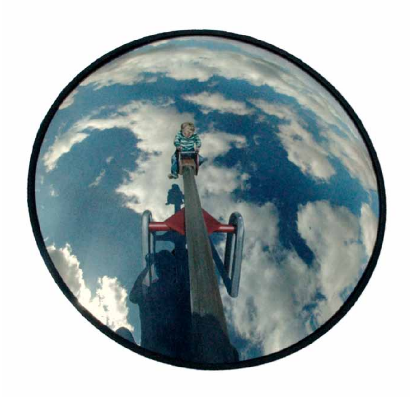
Play With Me oil on convex mirror 64cm diameter by 10cm deep