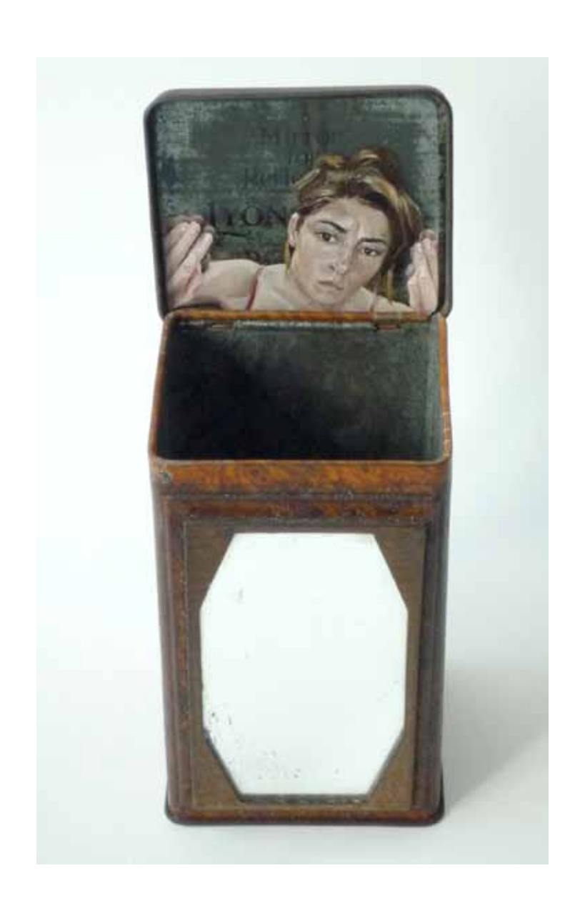
Mirror for Reflection oil on mirror in Vintage Tea Tin 18 x 8 x 8 cm